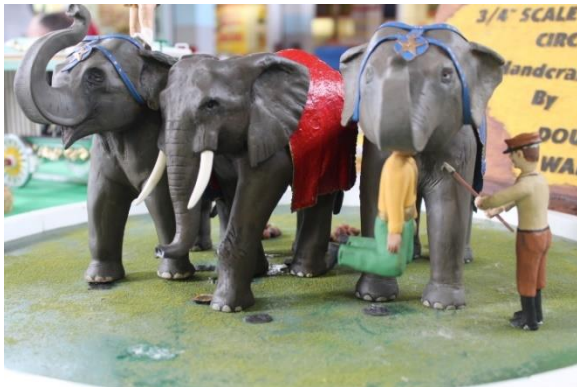
(Doug Konkle's handcarved 3/4" scale act)

The many visitors that came over the three-day weekend were excited to see so many things we don't see every day. The circus moved by wagons, tractors and trucks and all were offered in one form or another.