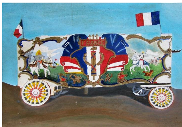
( Acrylic painting by Bob Cline – 1972 )

Out of town bidders will be able to bid live and before hand through liveauctioneers.com . An Online catalogue will be available for your viewing pleasure closer to the may Dates.